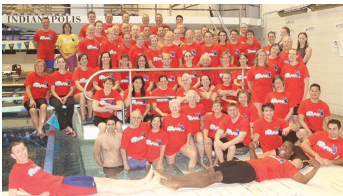
2013 Team - Short Course Nationals - Indianapolis, Indiana

in Michigan Masters history that the Club won a Short Course Yards Regional National Championship and the first time Michigan Masters scored more points than all Clubs including Local Clubs in the meet. 94 swimmers swam in the meet and 23 USMS Individual Championship titles and 2 USMS Relay titles were won including one USMS National Record. 71 swimmers scored in an individual event and 8 more scored in relays so 79 swimmers helped us win the National Championship. The margin of 328 points was the next closest Club.