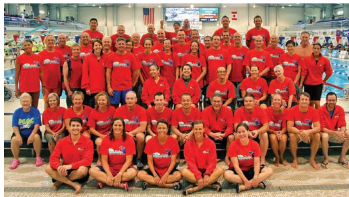
2015 Team - Long Course Nationals - Geneva, Ohio

In 2015, Michigan Masters won the National Regional Club Championship at the 2015 Summer Long Course Nationals in Geneva, Ohio for the fourth title. 32 USMS Individual Championship titles were won including 16 for the Women and 16 for the Men and 4 USMS Relay titles were won. 13 swimmers won a 1st place in an Individual event. 55 swimmers placed in their individual events and 4 more in relays so 59 out of 65 swimmers that attended scored in the meet. The margin of 1200 points was the next closest Regional Club.