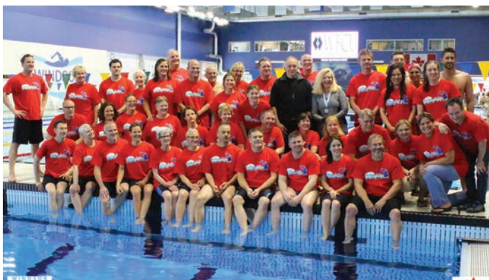
2014 Team - Canadian National Championship - Windsor, Ontario

In 2014, Michigan Masters was the first Club from USMS to win a Canadian National Championship. All 64 Michigan Masters swimmers that entered the meet scored and received a medal in an individual event. Also everyone who participated in a relay scored and received a medal and that really contributed to the total team effort. Michigan Masters swimmers were responsible for 4 USMS National Records, 35 Canadian Open Records, 65 Individual Championship titles and 22 Relay titles. Scoring was done to 16 places and a margin of over 2500 points was the next closest Club.