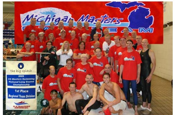
2009 Team - Long Course Nationals - Indianapolis, Indiana